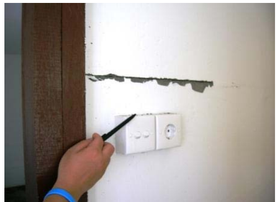
Panel-join need to be fixed