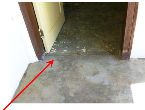
Concrete pad to the bathroom is missing