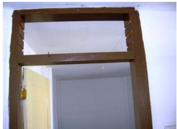
Missing window Jalousie's