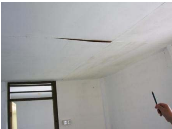
Ceiling panel need to be re-nailed