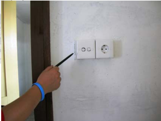
Defect & Broken Light Switches