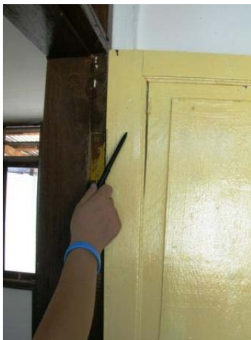
Doors need to be fixed