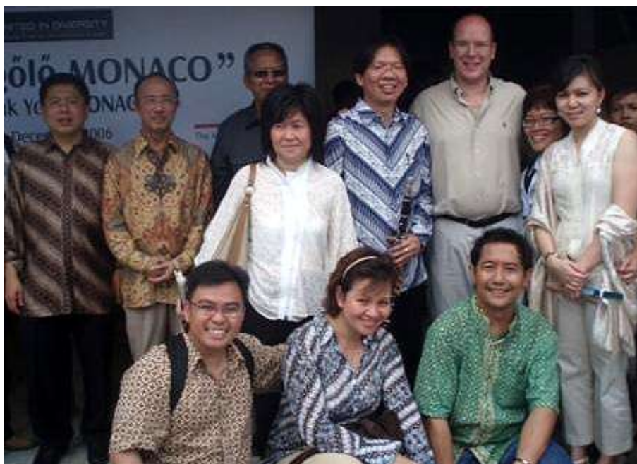
Prince Albert with the UID team and its partner YCAB

And, as mentioned in the fourth newsletter, we continue to partner with the Wheelchair Foundation to give wheelchairs to Indonesians with disabilities.