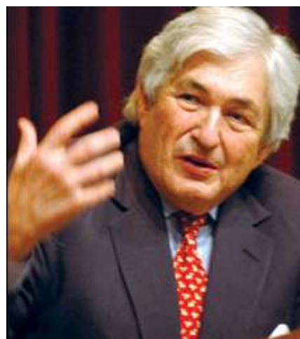
Former World Bank president and great friend of UID, James Wolfensohn

Thank you, Jim, for your generosity, unwavering support of and belief in UID!