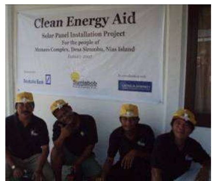
Launching our solar-energy project

As you may already know, the Monaco Complex is named after the Monaco-Asia Society whose generosity—in partnership with UID and its partners—has made it possible to build the 239 homes for tsunami victims and families in the Sirombu community.