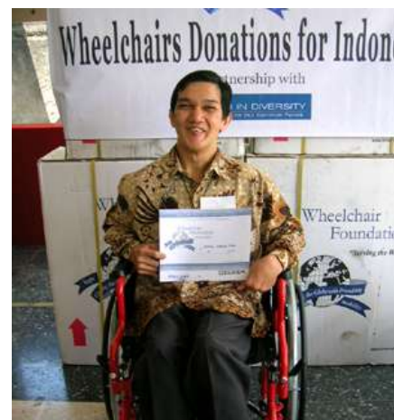
A recipient with his new wheelchair

thereby, contributing to environmental betterment. Through this campaign, we hope to educate residents in the Complex the importance of healthy living, waste management, and hygiene.