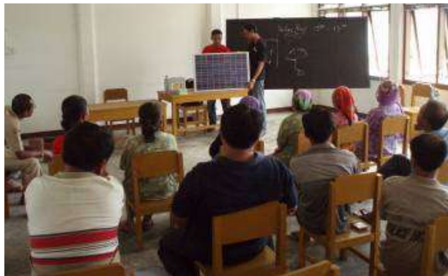
Recipients receiving instruction on how to maintain solar panels