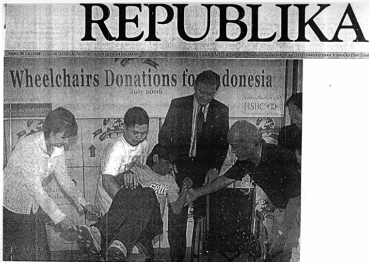
KURSI RODA: Sebanyak 28 buah kursi roda sumbangan diserahkan kepada penyandang cacat penghuni Wilma Cheshire di Jakarta Selatan, Selasa (25/7). Sumbangan itu merupakan hasil kerja sama UID dan HSBC Indonesia. Kursi roda tersebut sangat dibutuhkan oleh para penyandang cacat karena harganya yang relatif mahal.